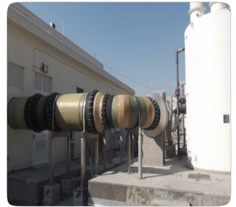
► GRP, GRE & GRV Pipes & Fittings