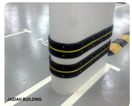
► Building Protection Guards (Speed Humps , Wheel Stopper , Corner and Wall Guards & Fenders)