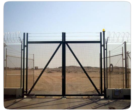
► Crash Barrier, Fencing