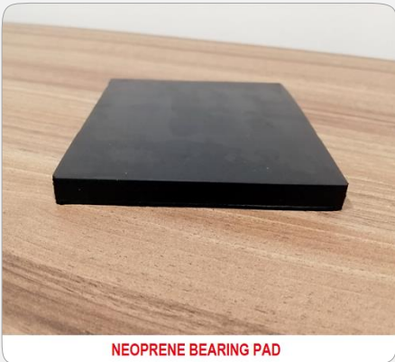
NEOPRENE BEARING PAD