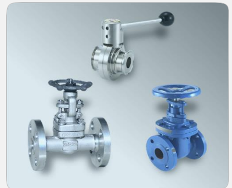
► SS Tubes & Fittings, Flanges & Valves