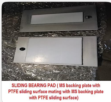
SLIDING BEARING PAD ( MS backing plate with PTFE sliding surface mating with MS backing plate with PTFE sliding surface)