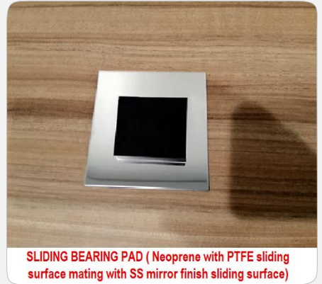
SLIDING BEARING PAD ( Neoprene with PTFE sliding surface mating with SS mirror finish sliding surface)