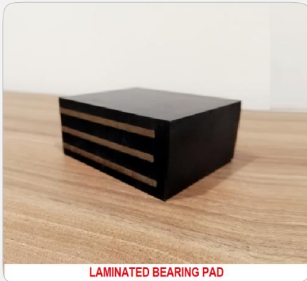
LAMINATED BEARING PAD